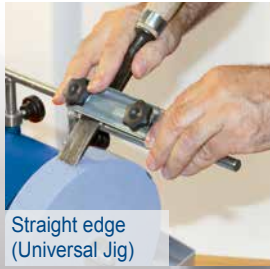
Straight edge (Universal Jig)